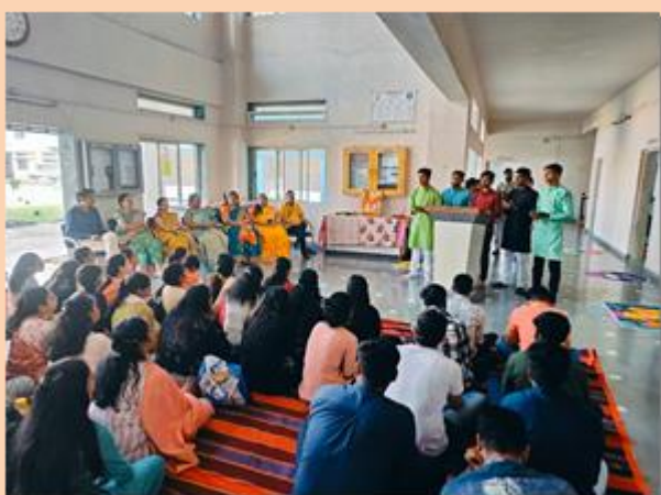
Diwali Celebration 2023