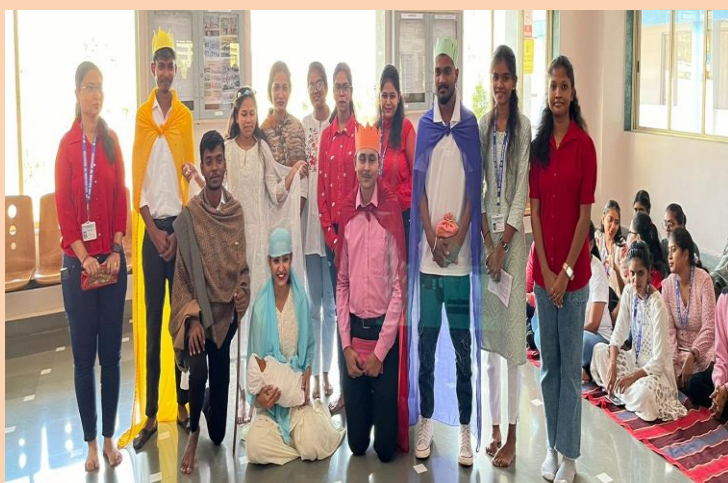
Christmas Celebration 2023