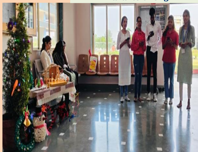
Christmas Celebration 2023